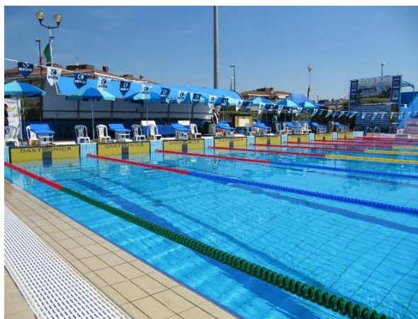
CORSIA FRANGIONDA BREAKWATER LANE